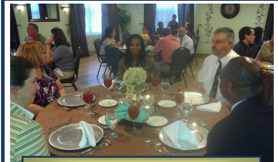
First time “Sold Out” crowd