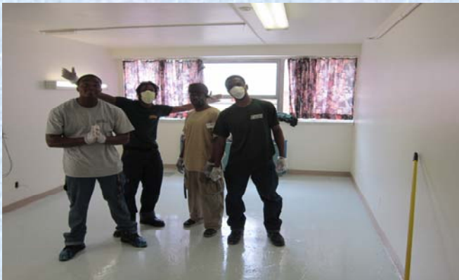
Work Based Learning Success