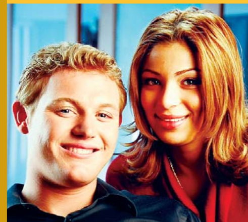
Look closely ... Everyone pictured in this brochure is an actual Job Corps student or graduate.

Glenmont also has a gymnasium, softball field, recreation hall and pool room, weight room, aerobics room, arts and crafts room and an indoor swimming pool.